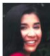
Lady in Street (Neighbor)