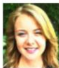
No. 40 (Neighbor)