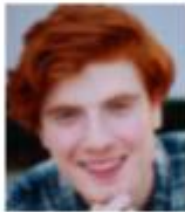
Man in Socks